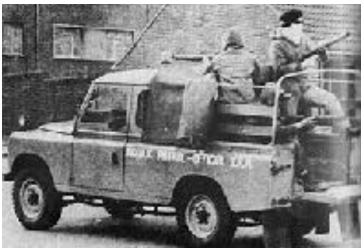
1972 Official IRA mobile patrol

Wanted to use policy means, but occasionally engaged in violence.