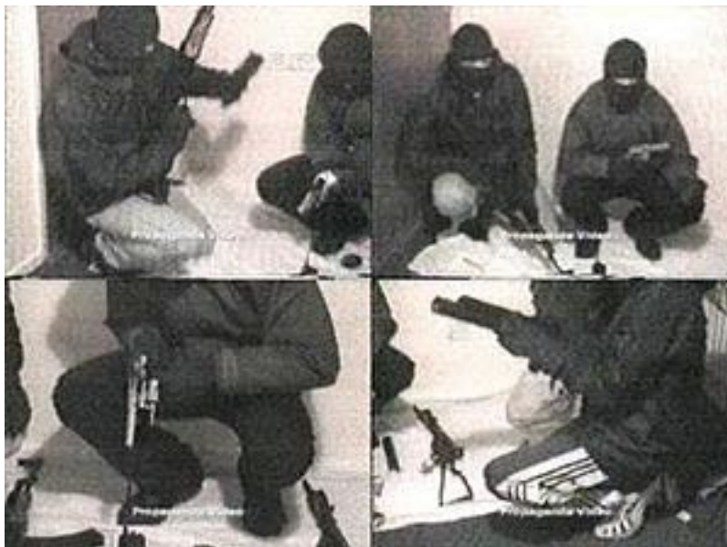
CIRA propaganda video

As far as guerrilla activity goes, 2 IRA splinter groups, the Real IRA and the Continuity IRA still practice terrorism today.