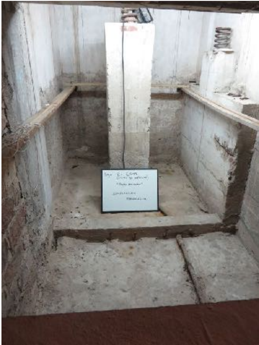
Cell in ESMA, the largest detention center and torture chamber in Argentina