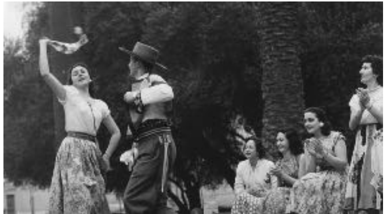
Chileans dancing the Cueca 1950s, before Pinochet

The Cueca was a traditional dance in Chilean working class culture. The dance involves a romantic conquest and reflects a sort of mating ritual. Young people were attracted to the dance because of its nature of rebellion, connection, communication, and individuality. Pinochet, the dictator of Chile 1973-1990, made many strict societal rules. Instead of banning the Cueca, he made the dance a part of military parades. The Cueca went from a freeing experience to a symbol of dictatorship and youths began to reject it.