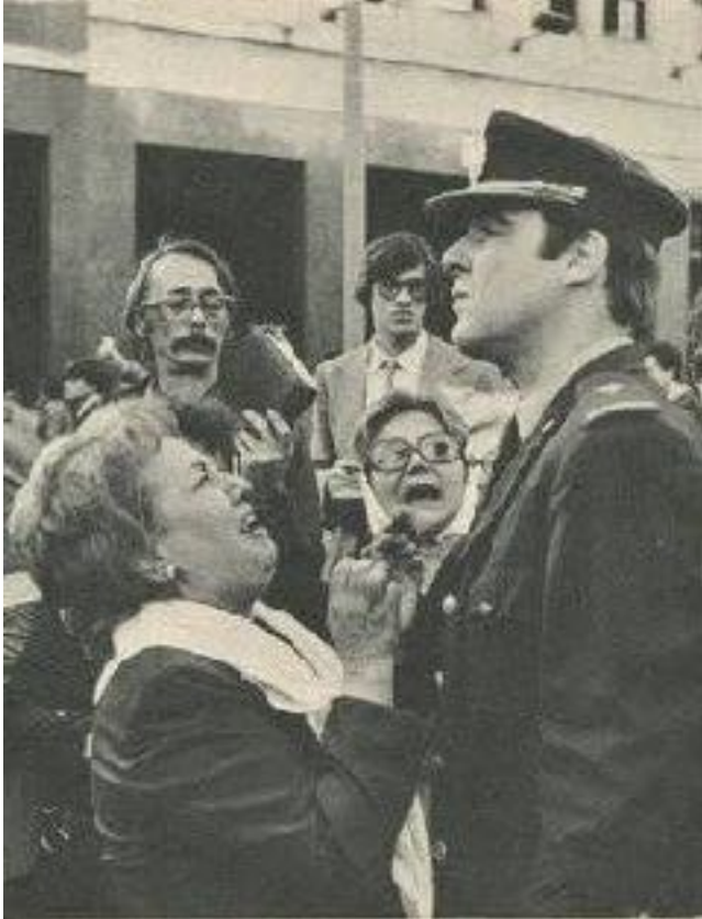
Madres of the Plaza de Mayo — Mothers went searching for their children who had been detained by the military. They would gather weekly to march in protest. Though men were often the targets, women lead the struggle to seek answers.