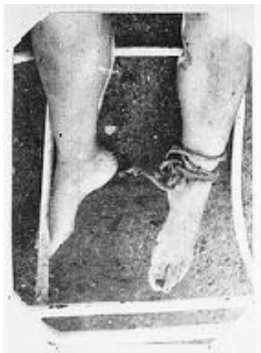
Body of woman imprisoned at ESMA

From 1976 to 1983, Argentina endured a military dictatorship known as the Dirty War. The military wanted to to reform the society to fit a conservative and Catholic vision and waged war on any left-wing sympathizers or anyone who opposed Western values. 10,00-30,00 people were disappeared after the government was seized, most of which were young Argentinian students and/or activists. Los Desaparecidos included men, women, and children. Victims were kidnapped and taken to secret detention centers where most were tortured or killed. 3% of the women who were kidnapped became pregnant from the rape of guards. After they gave birth, the mothers were "transferred" (which commonly meant they were killed and thrown off planes) and the children were sent to live with military couples. 500 newborns and children were taken from their parents. They were seen as "seeds of the tree of evil" and by giving them away to new "authentic" Argentinian families they would be replanted.