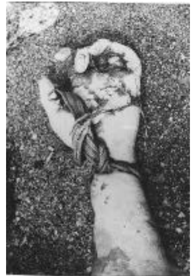
Body of ESMA prisoner

Even though the Dirty War has ended, it still remains. Kidnapped children continued to be prisoners, the erasure of their identity causing many mental health problems in adulthood. Those that endured the conflict were unable to move on and pushed to have justice. Threats against activists, survivors, and families of the disappeared still happen today.