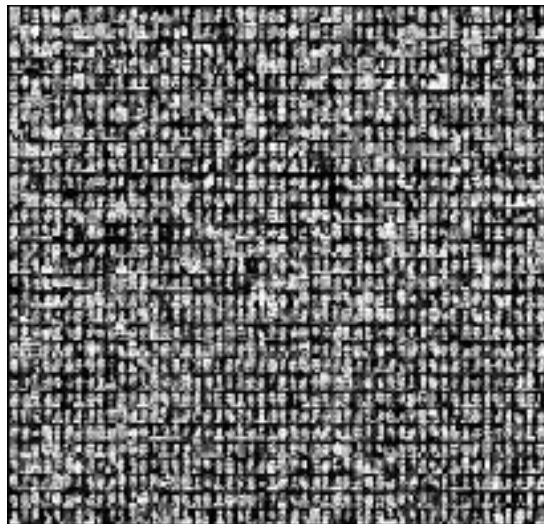
Photographs of Los Desaparecidos