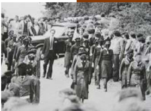
Female IRA fighters on parade